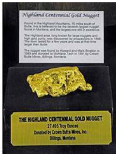
The Highland Centennial Gold Nugget, focus of this year's field trip.

Visitor parking passes will be issued to all attendees who request them when they register. Free shuttle service will be provided between all Symposium venues.